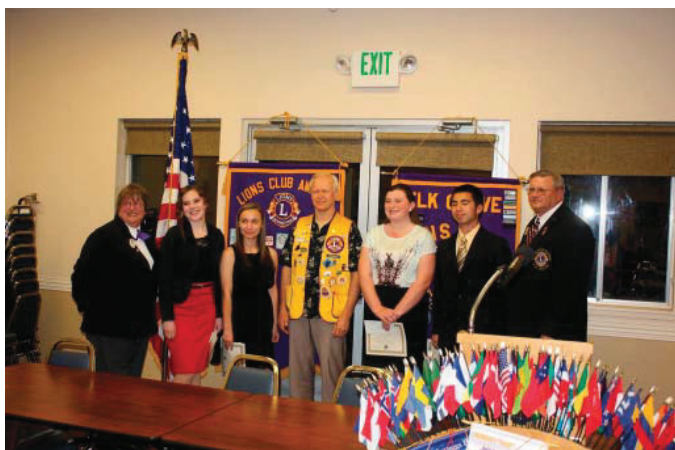
Everyone one else who had to have their picture taken?