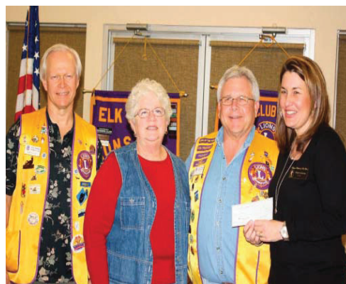
Strauss Festival accepting check for dinner fundraiser