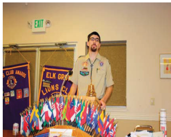
BSA Troop 59 led us in the Pledge and took time to thank us for our support.