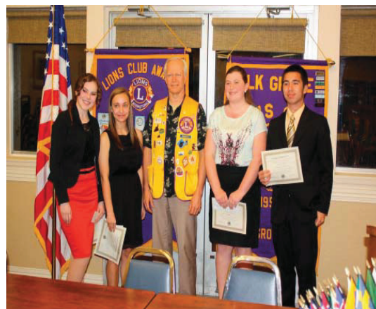
Student Speaker Contestants and our Captain