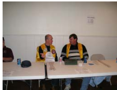
“Have I told you about the glory days when the Buckeyes were number#1?”