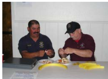
“Eatin’ is a lot more fun than actually selling tickets”