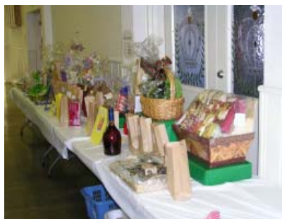
The raffle was more successful because of the new “choose the raffle prize you want”