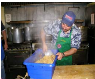
Cooking the pasta