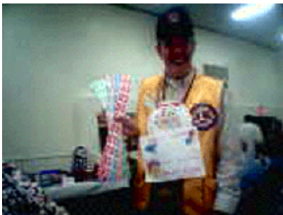
“I got plenty of tickets”