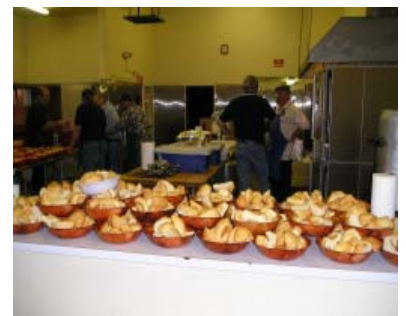
Life is more the a bowl of bread rolls