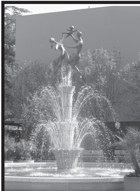
The "Spirit of Life" fountain is a source of hope and inspiration to the patients at City of Hope.

We listened while doctors talked about the incredible advancements they have made in finding a cure for type I diabetes. In 2000 a group in Canada discovered that you could transplant the insulin making cells (islet cells) from a donor's pancreas into the pancreas of a diabetic. In