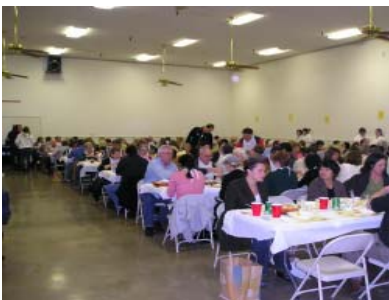
We had a full house