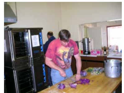
Do you think they will notice that little tip of figure?