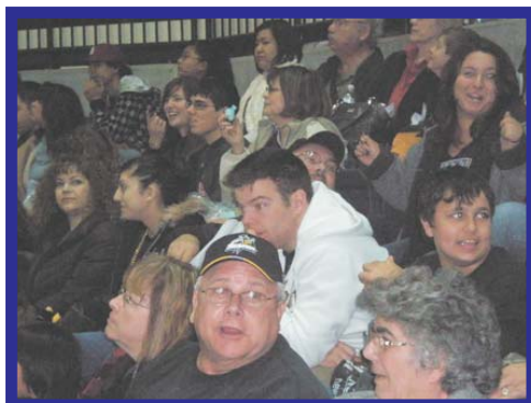
I think my regular seats are better!