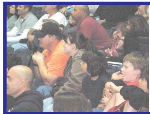
This game takes a lot of concentration!