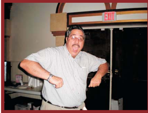
Wanta see me do "The Chicken"?