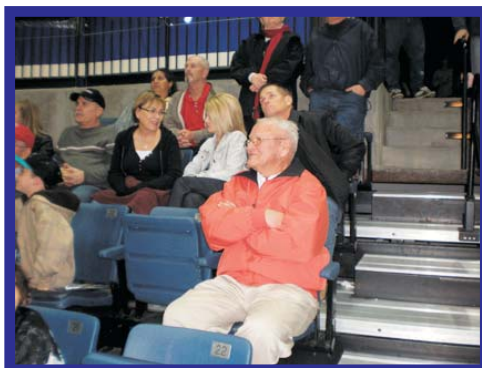
In the Day . . . This was a lot rougher game!