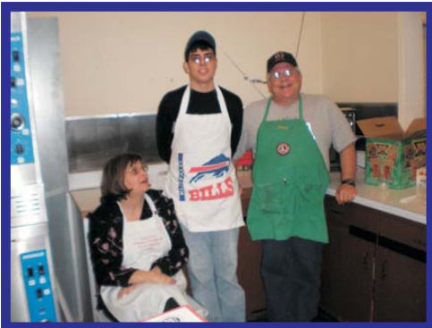
The calm before the storm!