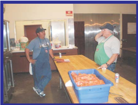
We got alot of "Take Home"!