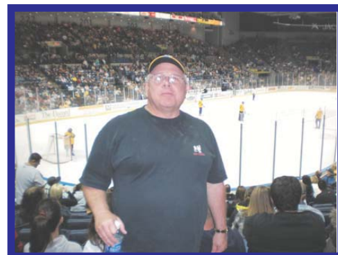
I'm going to my regular season seats . . . in the luxury boxes!