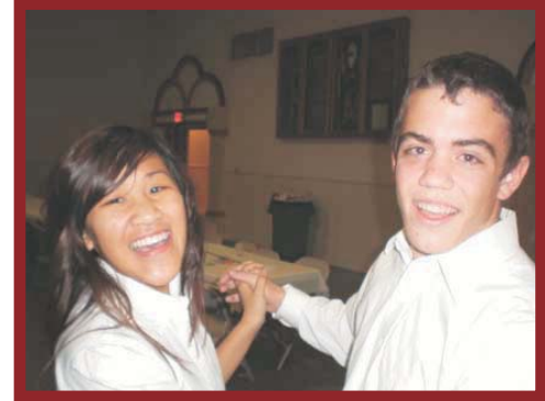
Left foot . . . Right foot . . . Slide