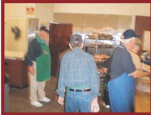
Directing traffic is very important!