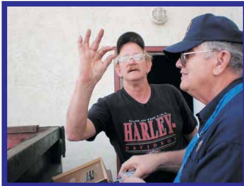
I found a tresuer when Dumpster Diving!