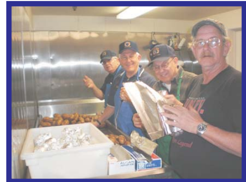
That's 1 piece of saran wrap or two?