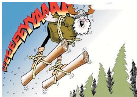
LEGEND HAS IT THAT SKI JUMPING STARTED AS AN ANCIENT SCANDINAVIAN DIVORCE CEREMONY.