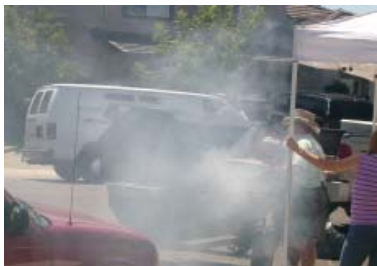
Do you think, we've burnt the dogs?