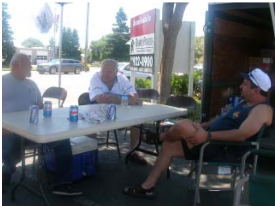
So what shall we do? . . . .. have another pizza?