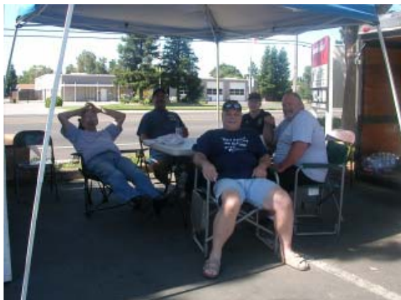
Man is this the life? I thought you guys said, 'being a Lion is tough'