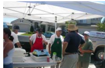
Well, what's the hold up?