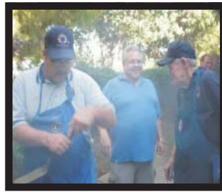
I got a burnt one ready!