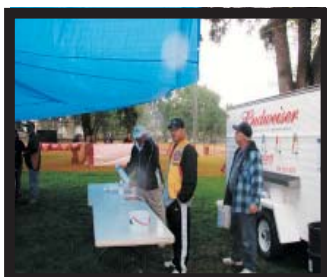
The bar was kept busy?