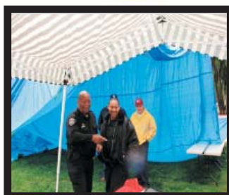
I think there was adequate security!