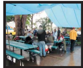
I take "back" pictures, JS