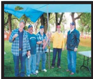
We're ready, where is everybody?