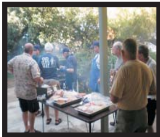
Okay, I'm taking a picture. Everyone turn around.