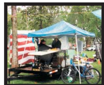
I'm keeping all the balls dry! No Ping Pong Bingo balls!