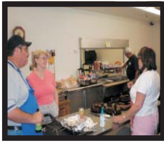
Can I get a membership application?