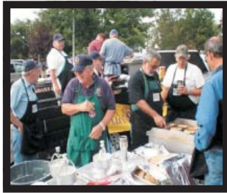
Who just pinched me?