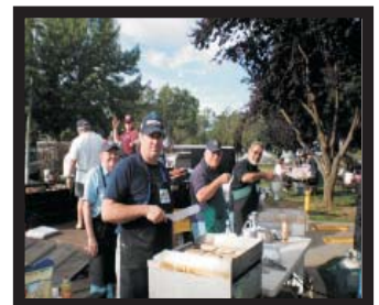
I love pancakes!