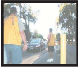
I think this is a friend, get him for double!