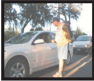
Restrooms? There right over there! Now give me the ten bucks!

ELK GROVE YOUTH SPORTS FOUNDATION PRESENTS