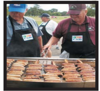
Isn't there another name for these?