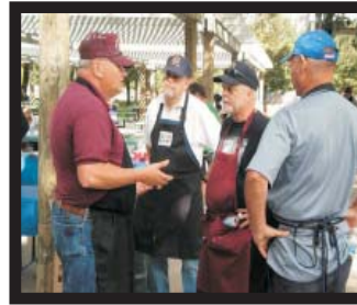
I've trying to get them to have one of these at each Cabinet meeting.