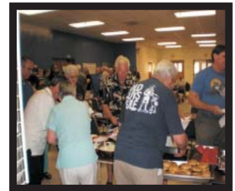
Oh boy, these are cooked just right!