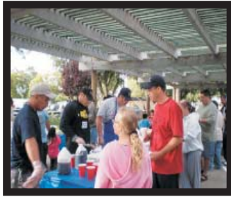
One more order of S.O.S.!