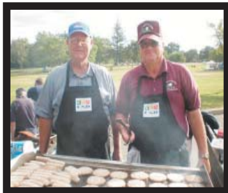
I love them Powdermilk Biscuits!