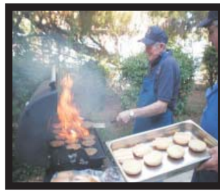
It's all about "fire"