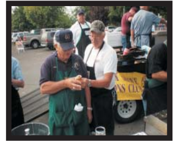
Should I add a little bit of this Cayenne Pepper to the Srambled eggs?