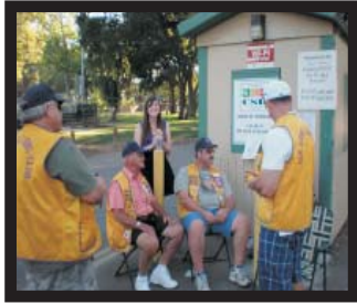
Just how much are we going to rake-in from this thing?