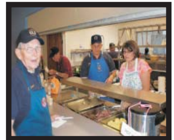
You want extra what?