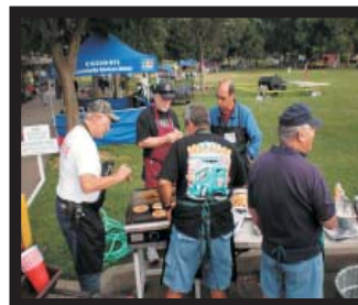
I'm going to add some of my special ingedients to the recipe.