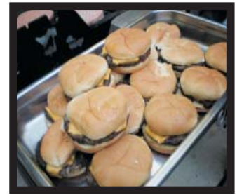
I'll gladly pay you Tuesday for a hamburger today!