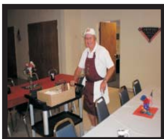
Salt, Pepper, napkins, "what else"?