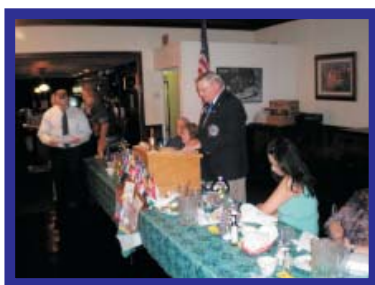
New Region Chair