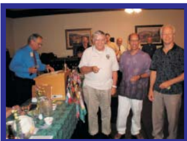
Looks like "Athos, Porthos & Aramis"