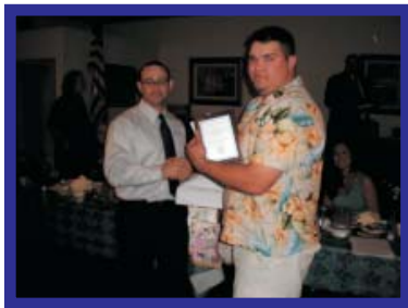
HO - HO - HO I'm A Winner!