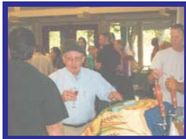
I have a really have a great Merlow that goes with everything!