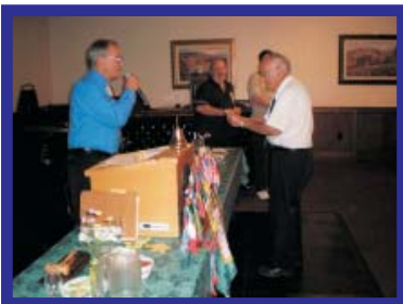
What am I doing for? Lion Mel YOU have more experience!