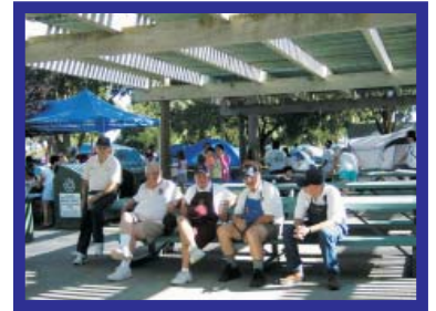
YEP . . . Things are on "cruise control"