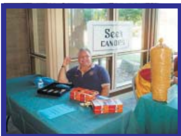
Hi, I'm the new PREZ!