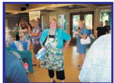
Where's all the Lions?