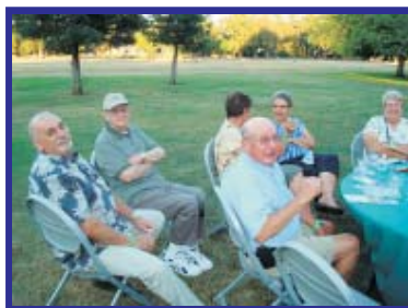
I think this Wine Festival is on Cruise Control!