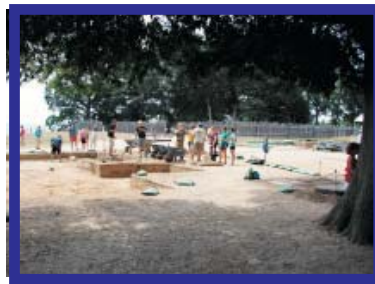
Digging up relatives?