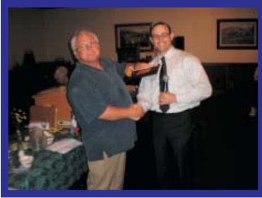
It's your club now!