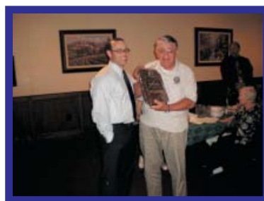
LION OF ALL TIME!