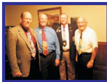
HO - HO - HO Would you buy a car from any of these guys?