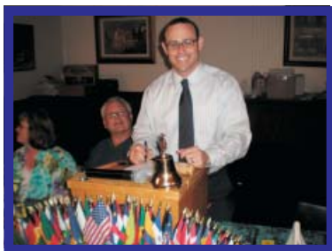
HO - HO - HO I'm Passed!