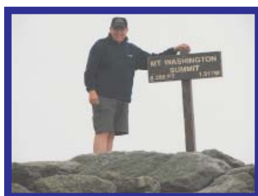
Top of Mt. Washington. There's an old tale that says George threw a quarter off the top?