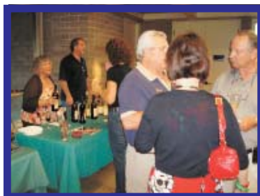
This isn't as much fun as a Hockey game!