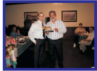
Lion of the Year.