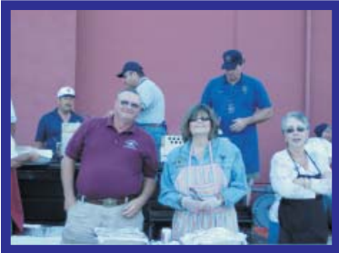
Goodness - Gracious are we happy campers?

Community volunteers and local celebrities donate their time to be shopping escorts and generous local retailers, businesses and community sponsors provide both financial assistance as well as donations of backpacks, school supplies, hot food and new clothing.