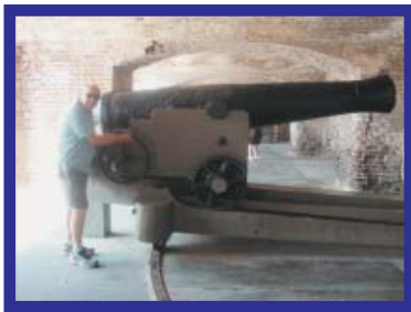
This IS the actual cannon that fired the first shot! Well, that's what we were told!