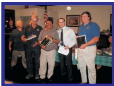
Everyone gets an award!