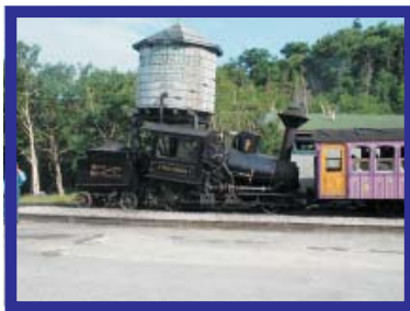
The train engineers were really uncomfortable