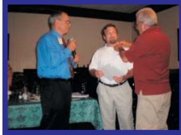
Our Baby Lion