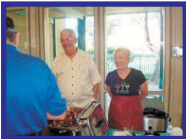
Did you know that we have a Catering Business?