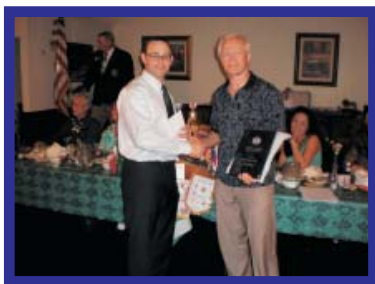
An award for on-time 100% attendance