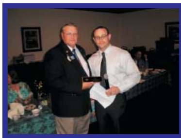
This for having my back!