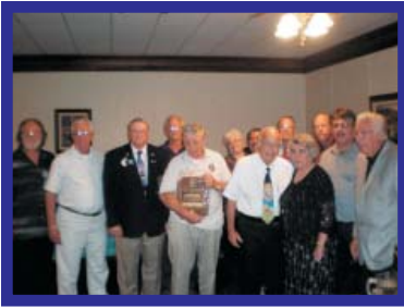
Smiles Everyone . . . Smiles