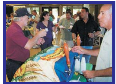
I don't care about no Merlow . . . Just give be a brewski!