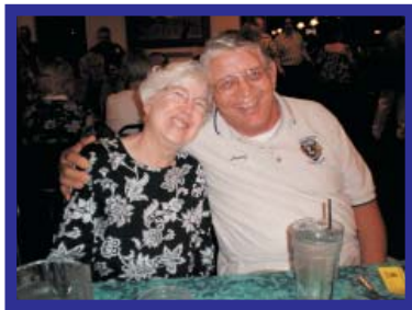
HO - HO - HO Aren't WE Cute?