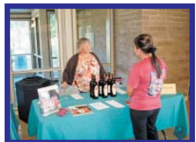
You know look old enough, can I see your driver's license?