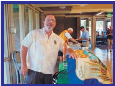
Hi, can I help?