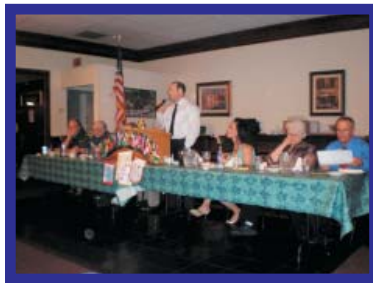
HO - HO - HO Sunni & I are on Vacation!