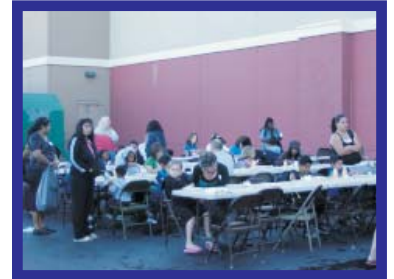
Love those Flap-Jacks!?