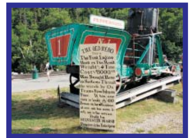
Get a magnified glass you might be able to read the story? I couldn't!