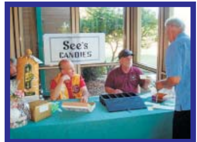
What to buy a raffle ticket?