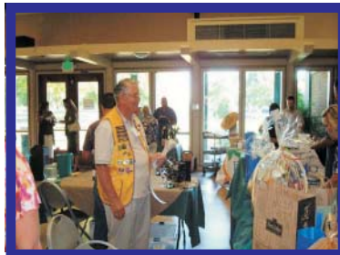
Which way to the FREE stuff?