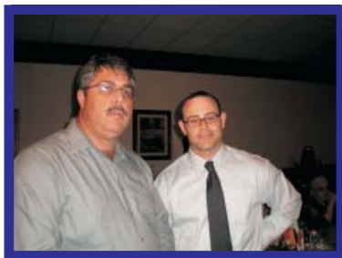
Like deer in your headlights?