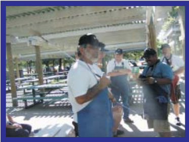
Well . . . I think everything is in order?