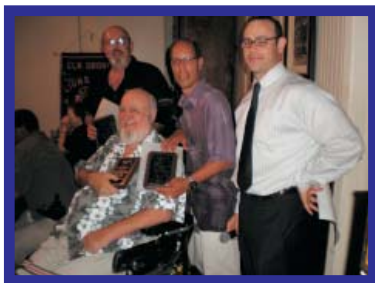
Who the hell is the fat guy in the chair?