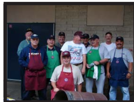
How many 'cooks' does it take to prepare dinner? As many as show up!