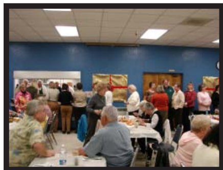
Two guys waiting for the call . . . dessert time!