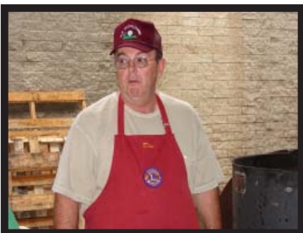
What? Me Worry? I didn't do anything, but COOK . COOK . COOK.