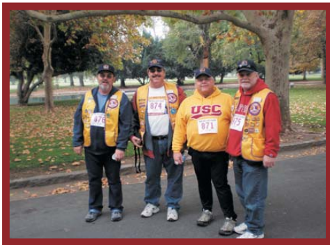
There were 5 Marx Brothers - so who's missing?