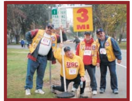
How do these goofers think they can actually "run" 3 miles?

My Sister's House seeks to eliminate domestic violence in the Asian and Pacific Islander community through family education, and by increasing the self-determination of Asian and Pacific Islander women.