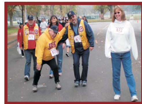
Is she walking for "their" inspiration?

The mission of My Sister's House is to serve the needs of Asian and Pacific Islander women and children impacted by domestic violence by providing a culturally appropriate and responsive safe haven and community services.