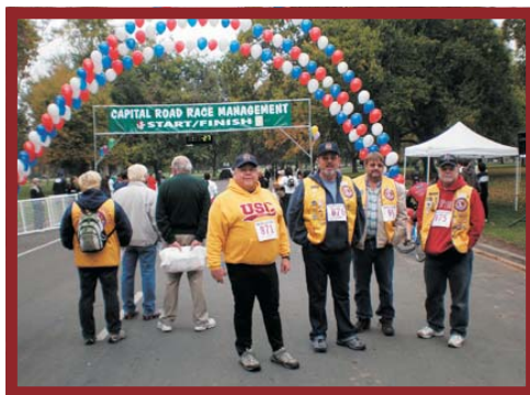
This picture must have been taken before the race! They're sanding up?