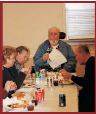
Best darn chicken I've ever had!