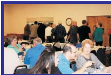
Grand Ma . . . This is what it's going to be!