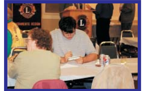
Let me see . . . what did Dad tell me about texting before dinner?