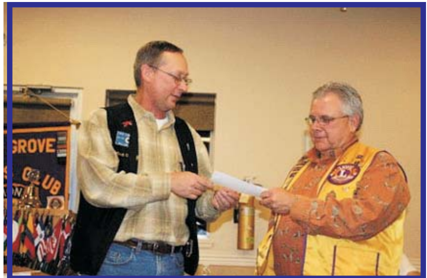
Galt Lions paid a personal visit to pay our share of their fireworks booth!