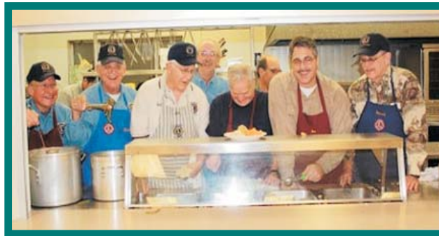
WE IS THE COOKS ?????