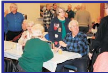
No, no, no I had "NOTHING" to do with tonight's dinner!