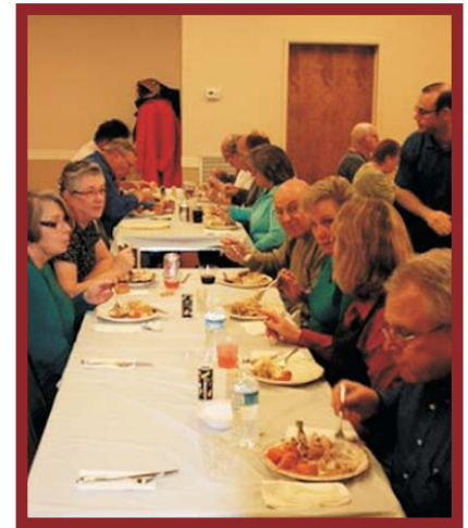
TWO empty seats . . . accross from the Pres?