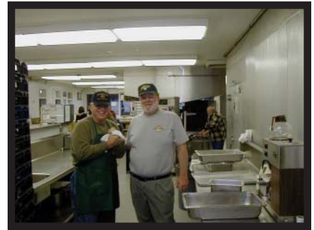
he Tr a e h t d' as e f h