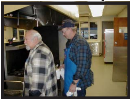
e m o C n , o y dd yd ou uo woh oys oh t o ! d t