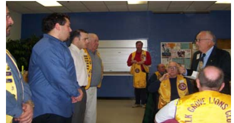
Okay guys, repeat exactly what Lion Mel just said!