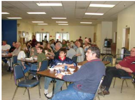
Over 60 party goers enjoyed a Sunday afternoon