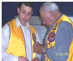
Now Grandpa, what do I say when Lion Sterling come over to where I'm sitting during meeting?