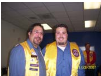
You know if you play your cards right, I can get you a job as Secretary...