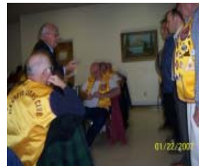
More "and, if, & butts"