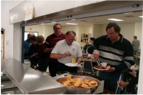
As soon as the meal bell rang, the lines to pick up the chow was served!