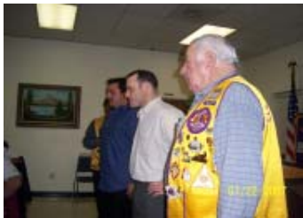
Gee, I don't remember promising all that!