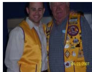
No! I won't pay your fine!