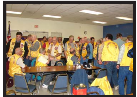
EVERYBODY congratulates Everyone else!