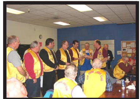
District Gov "pins" Sponsor Lions