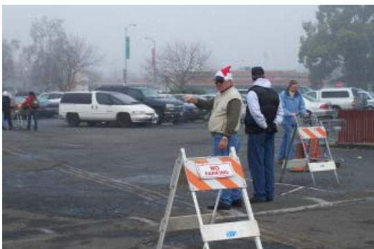
People . . . people . . . come-on you people THIS is the way!