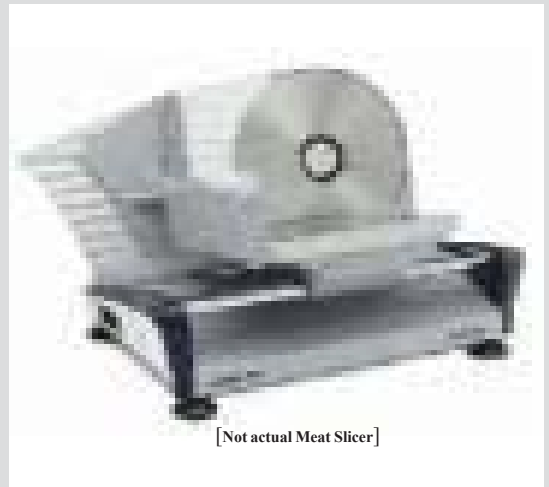
[Not actual Meat Slicer]

THE CLUB HAS A MEAT SLICER TO SALE TO ONE OF OUR MEMBERS.