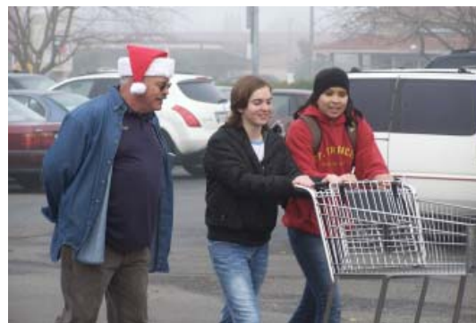
Girls . . . Can I give you directions?