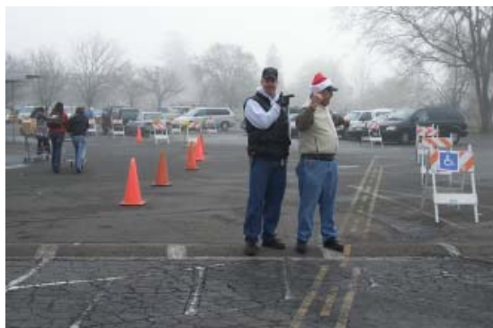
Which finger is he holding?