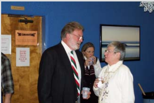
Ho - Ho - Ho . . . and what do you what for Christmas?