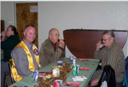
Is this the “Seniors” table?