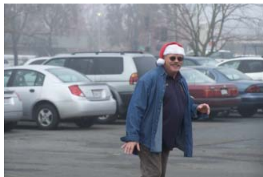
I'm wearing these dark glasses because the sun is sooo bright!