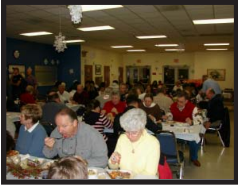
A festive time was celebrated by everyone!