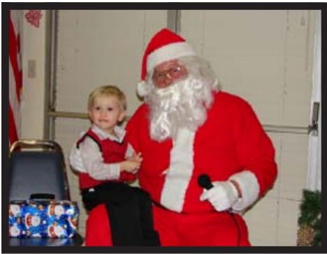
“Hey Santa, I just wet my pants”