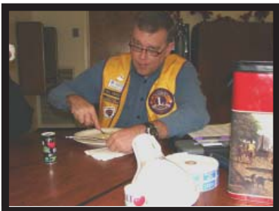
“Hey Dude, I know where you live!”