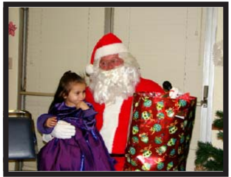
“You want . . . to join the Lions?”