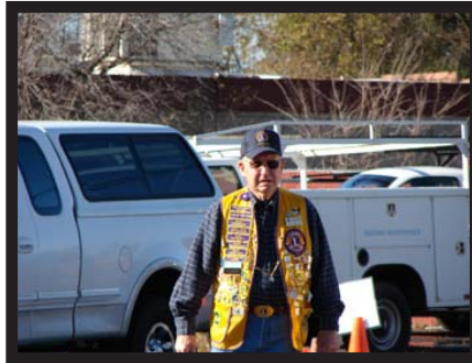
Nobody told me that when I volunteered that I would be a traffic cop!