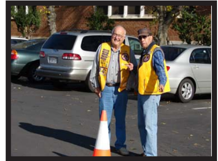
Okay I think I got it. I direct them down this isle of cones, and then right out of the lot!