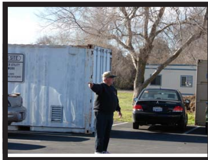
This is the way OUT!