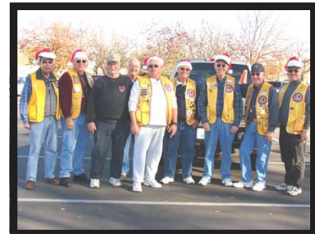
So how many traffic assistants does it take for this little parking lot?