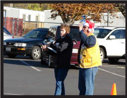
Now, let me see if I have this right? They come in this way and where do they go?