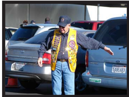
Pull up until to hit my hand. And watch out for my toes!