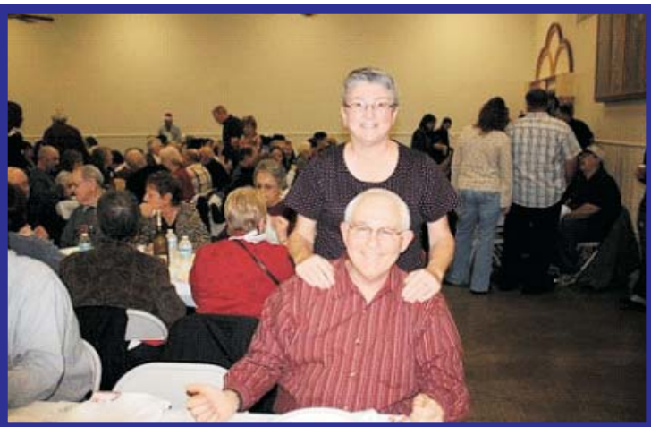
ENJOY THIS EVENING HONEY! IT'S YOUR CHRISTMAS PRESENT