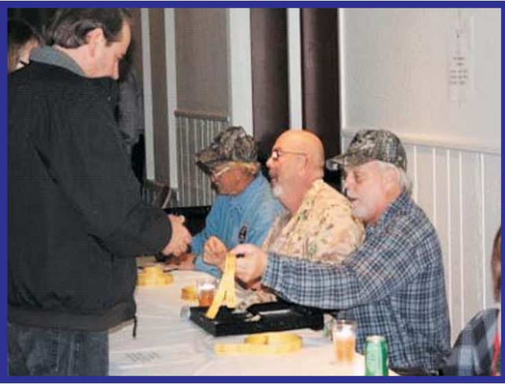
HERE, LET ME SELL YOU A COUPLE OF LOSERS