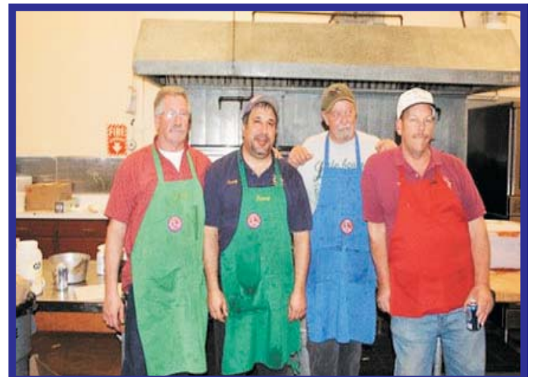
WHAT A MOTELY CREW?