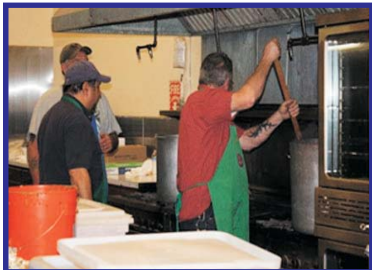
I HAVE BEEN STIRING THIS STUFF FOR TWELVE HOURS! WHEN WILL IT BE DONE?