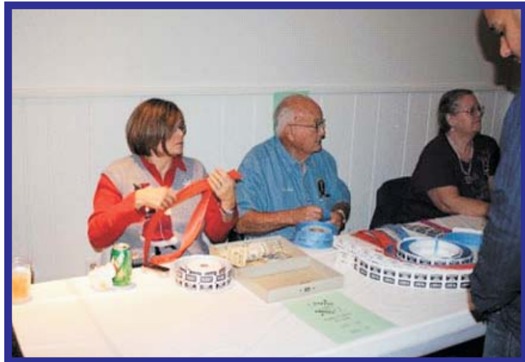
LET'S SEE YOU WANT 10 ORANGE, 10 BLUES, AND HOW MANY REDS?