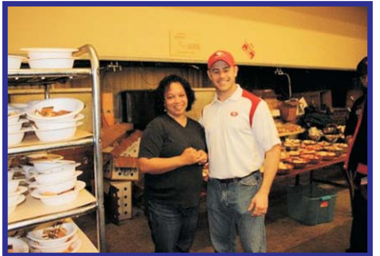
I'M A BANKER - NOT A BAKER!