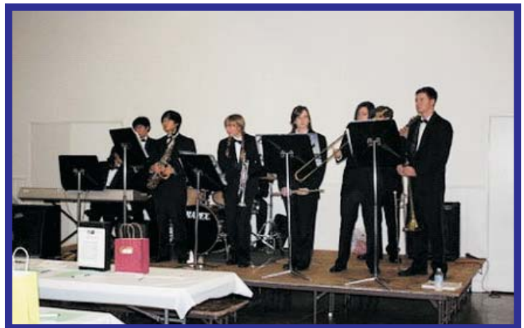
FINALLY MUSIC "WE" CAN ENJOY!