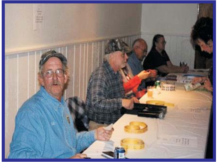
KIND OF LIKE "DEER IN YOUR HEADLIGHTS"?