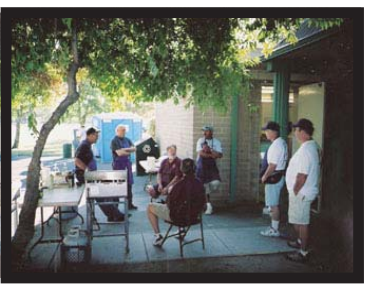
Boy if it weren't for these breaks once in a while, I just couldn't keep up the pace!