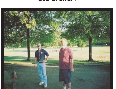
I guess I'm about finished with my year as Zone Chair Did a good job, didn't I?