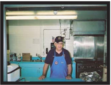
Lets see, that was "two all beef patties, lettuce, cheese, pickle, on a sesame seed bun"?