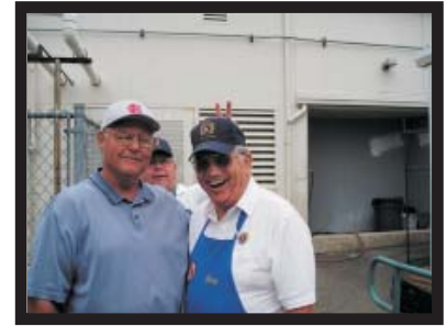
Hi, I'm "Hin-ni" What's your handle?