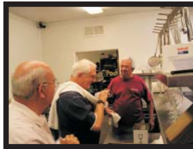
Just give it a dose of pepper . . They'll never notice the difference!