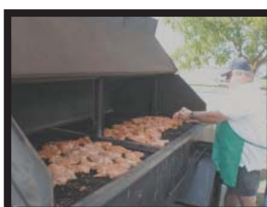
I don't think they're done yet!