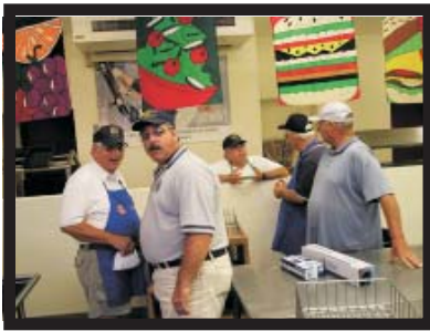
Okay, what do I do now?