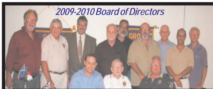
2009-2010 Board of Directors