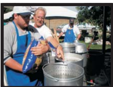
Add this entire bag of salt? I think something is wrong!