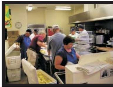
Added the right ingredients is very important!