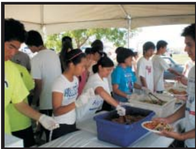
How many people have we fed?