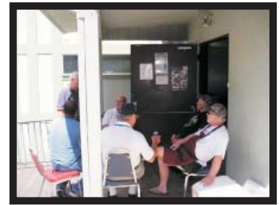
My goodness am I tired!