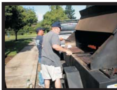
We're the best cooks in Lions!