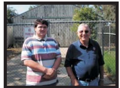
We are the best watchers in Lions!