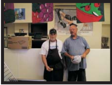
I got the yoyo . . .