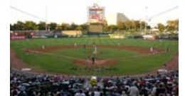
Come see some great Pacific Coast League action with the River Cats and Beavers!