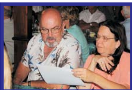
This tells me honey, that I will be away several nights on Lion business!