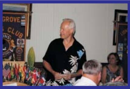
What do I do now???