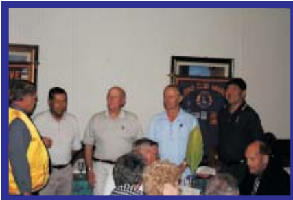
Lion Directors accepts there oath of office.