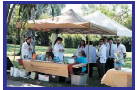
Lions helped serve and parking patrol at the Senior Center's "Spring" Open house and Community