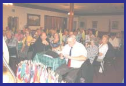
A large crowd turned out for the Installation dinner.