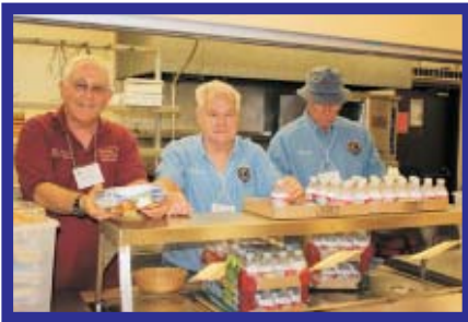
Mess Call !!!!