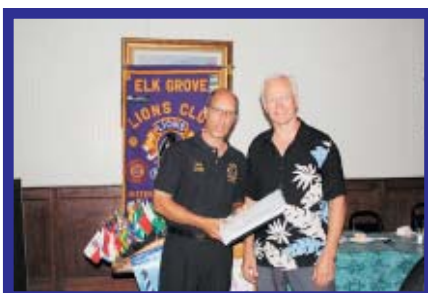
Who's got the biggest smile?