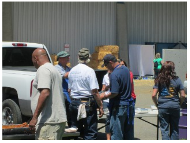
Lions Supporting FFA at County Fair