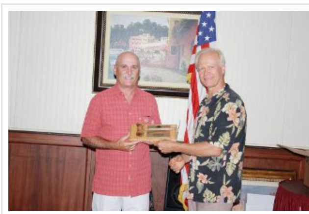
Passing of the Gavel