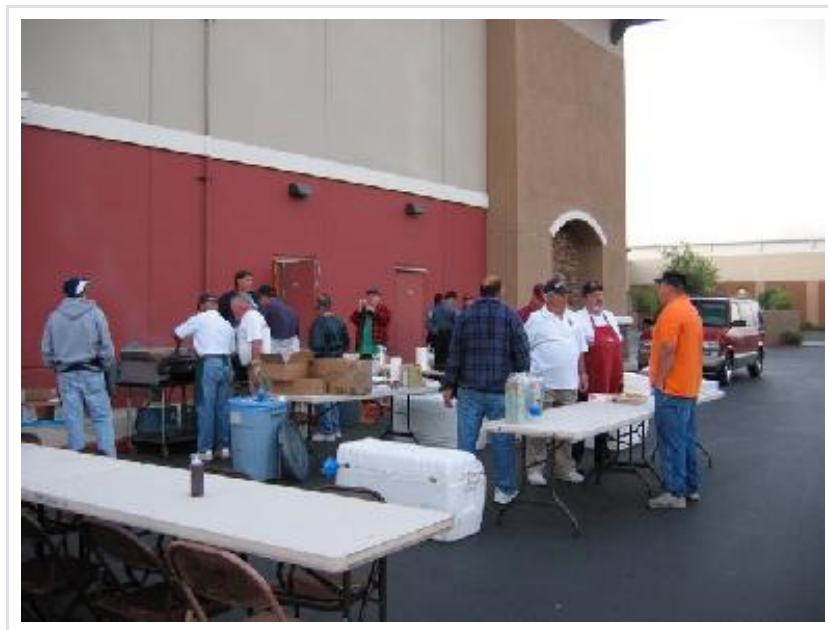
Lions Cooking Pancakes at a prior Child Spree Event

We will be cooking pancakes to support Kohl's Child Spree for Kids on July 27, 2013. Check out some of the photos of one of our cooking crews from a prior year.