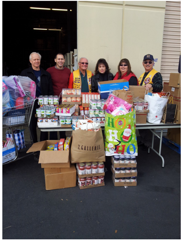
Lions Donation to Food Bank Last Winter