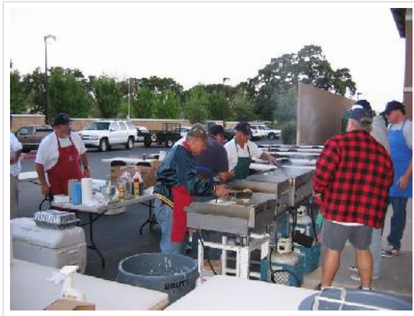
Lions Cooking Pancakes at a prior Child Spree Event