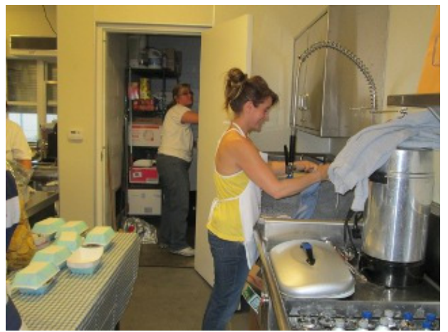
Lions Supporting FFA at County Fair