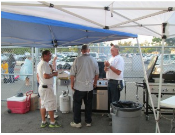
Lions Supporting FFA at County Fair