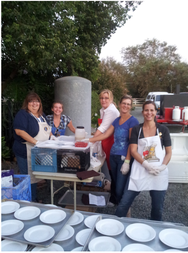
Cooking Crew at Transition House Rehab Event in February