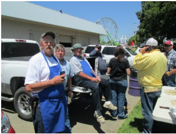
Lions Supporting FFA at County Fair