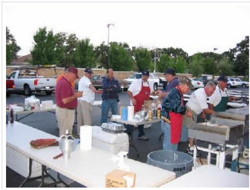
Lions Cooking Pancakes at a prior Child Spree Event