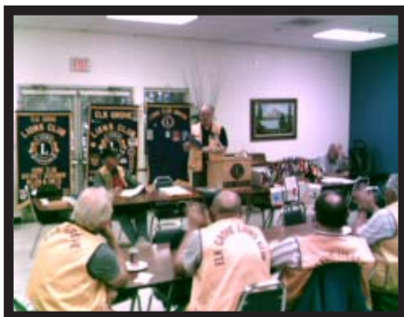
Okay Guys, I only have two months left.....