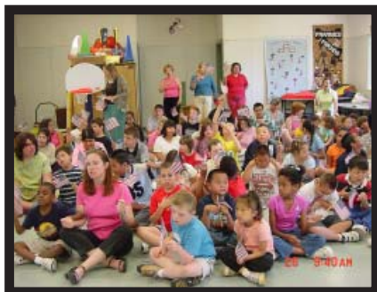
The students at Jessie Baker School really loved the American Flags.