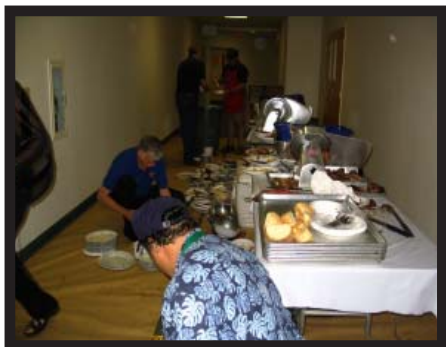
Dishes and . . .

Lets see we served 680 dinners which was . . . . 680 plates, 1360 knives, forks, and spoons, more than 680 cups and glasses. Rub-a-dub . . . 3 Lions in the HALL?