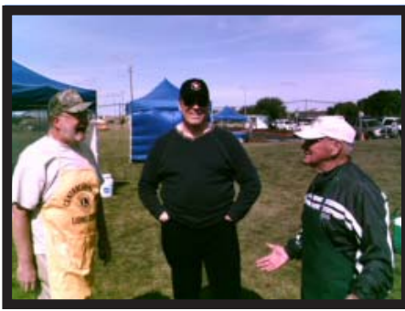
Guys, this is the way we did it in Freemont!