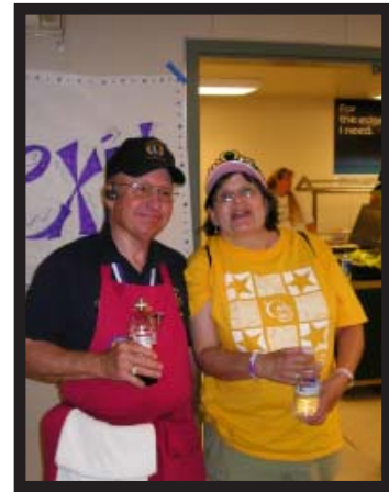
Nobody knows that I can't hear a thing with by radio on!

How many Lions does it take to boil water?