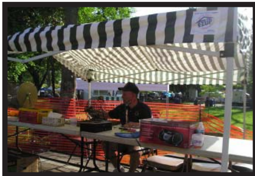
Okay, Okay . . . I know there isn't a D 76! I was just trying to be funny.