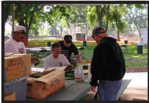
Bingo is soooo much fun, but wouldn't it be better if we had some players?