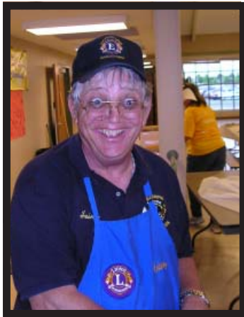
Golly Gee, I'm having sooooo much fun!