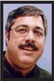
Lion President Elect:

The Sacramento County Fair, River Cats Baseball Game, Relay for Life and the senior class breakfast for Elk Grove and Sheldon High Schools are in the book. Thanks to all of our