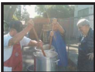
I'm leavine the heavy work to you guys!