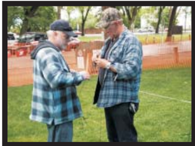
I'll trade you a plastic thing-a-mobs for two whatca-ma-call-its.