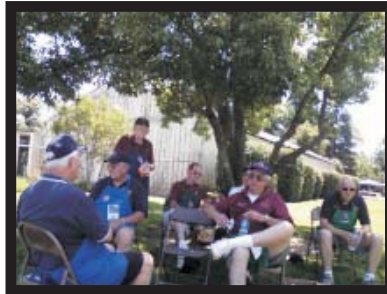
Still on a break!