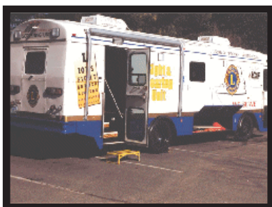
Great Eyemobile --- Not to great Motorhome!