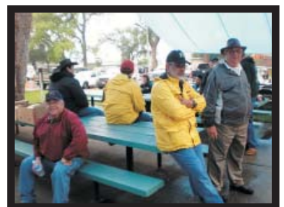
I can't wait all day!