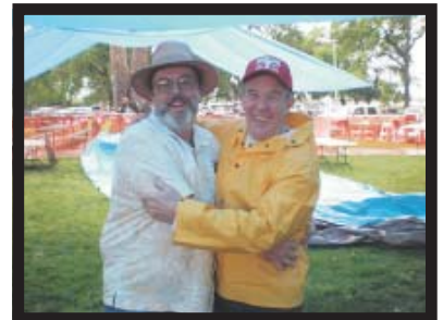
Hey ... another "Buckeye" fan!