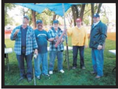
Well! Should we set up?

Weather Forecast: Partly cloudy with slight chance of rain! . . . "SURE?"