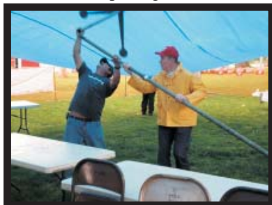
Just put it in the hole and raise the fxxxking thing up!