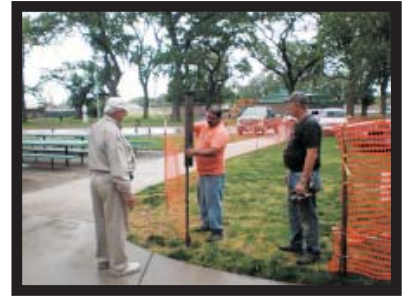
Okay, a little deeper . . .