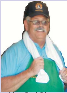
Lion Rod Dixon