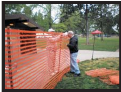
This fence will keep back the throng of stampeding crowds!