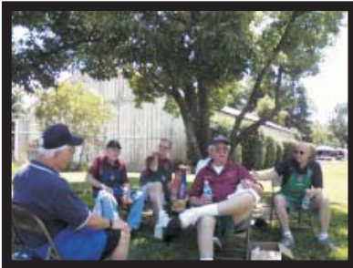
Hard! Working crew takes a break!