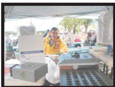
Dud, what's all the ping pong balls for?