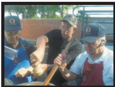
What do they say about too many cooks?