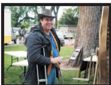
A couple of brews and I'm set to go!