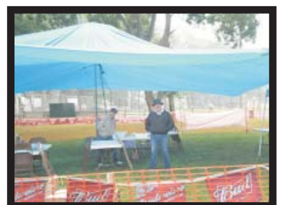
We're got prizes, prizes, and more prizes . . . for everone!