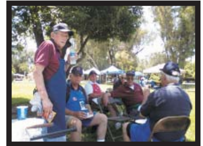
We've been caught!