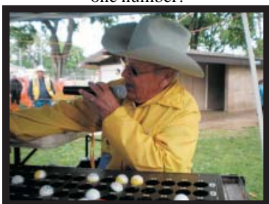
I've been calling BINGO before most of you were even born.