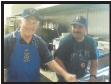
I'm a happy cook!