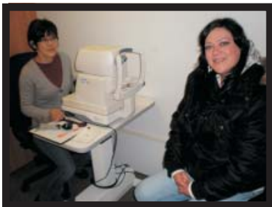
I can SEE!