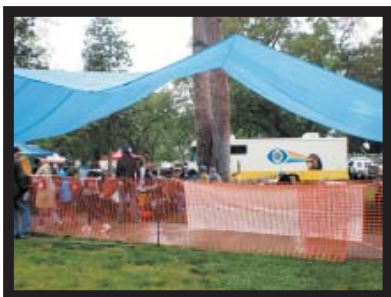
Who said BINGO, I've only called one number!