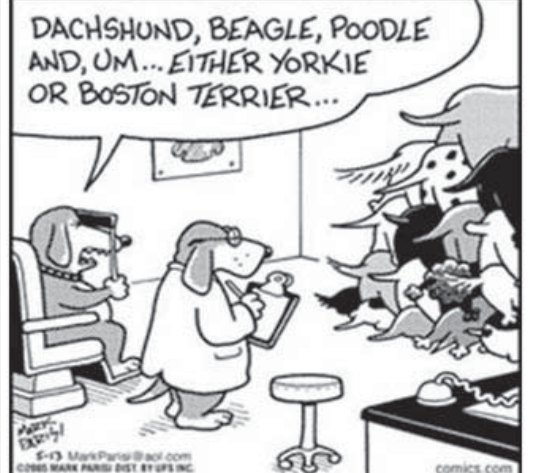
BUDDY GETS HIS NOSE CHECKED