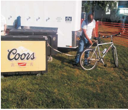
Got Bike ?