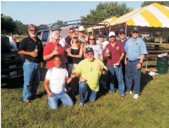
What a crew ?