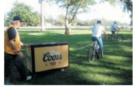
Pancho pendling his beer all over the park?