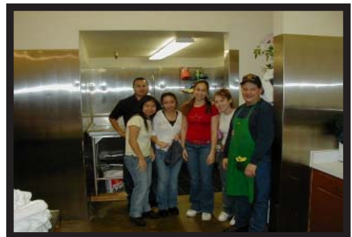
Dish Washing Crew