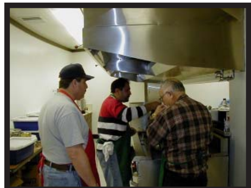
How many chef's does it take to prepare dinner?