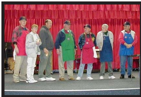
Kitchen Crew receives accolades at the Boy Scout "Blue and Gold" Dinner