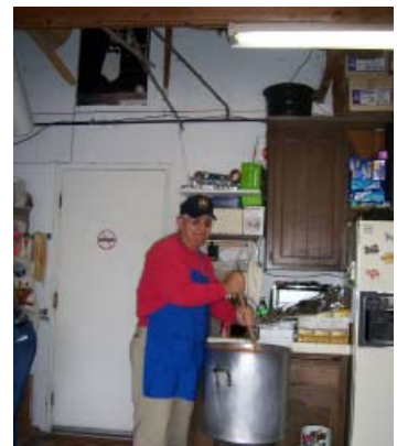
He told me that I only have to stir this until he gets back from coffee.....