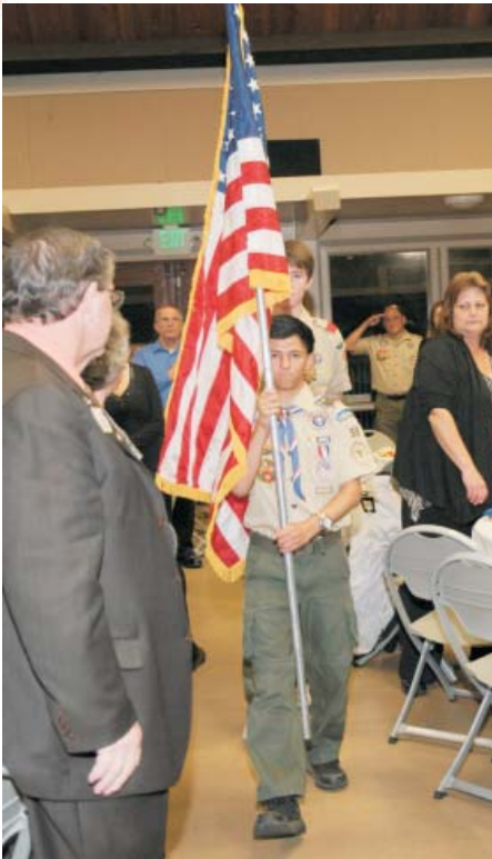
Boy Scouts from Troop #59 present colors!