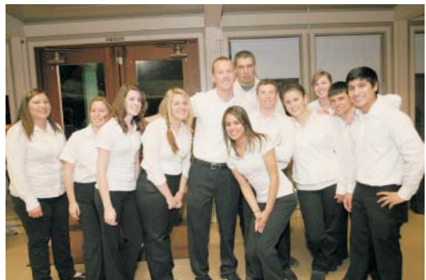
Galt FFA provided "super" service!