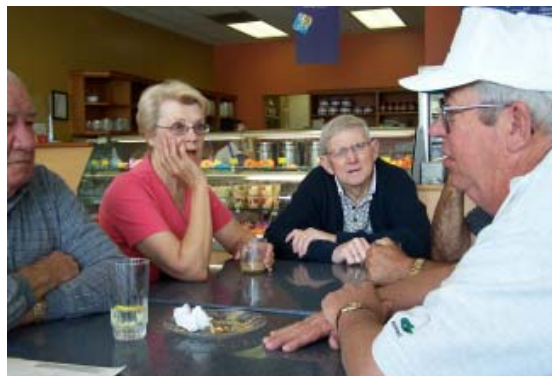
Until their moved to Idaho, the "Coffee Shop Crew" (the real brains behind the Elk Grove Lions), had a secret weapon?