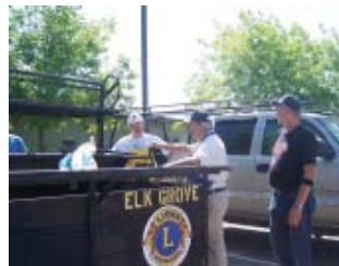
Okay, who tossed all this crap in the trailer?