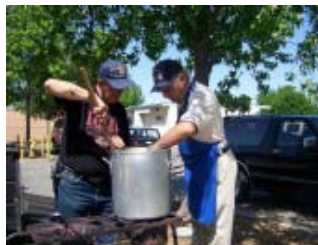
Be very - very careful, these beans are easy to burn!