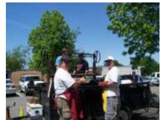
These dogs taste really good! Maybe we should save a couple for the kids!