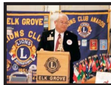
Senator Lions - Lion James Fong candidate for 2 nd District VP