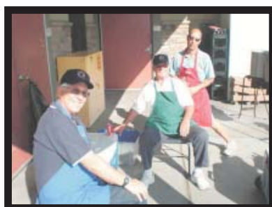
The Three Musketeers