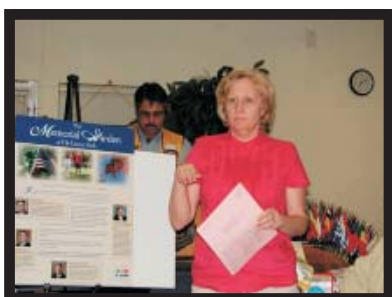
Exective Director of the Senior Center - Thanks the Lions