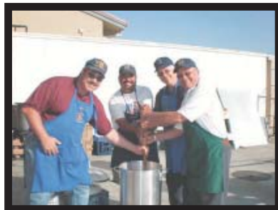
How many cooks does it take to ruin the stew?