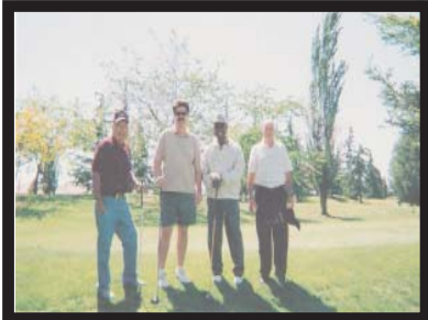
When I was told Golf . . . I thought they meant PeeWee Golf!