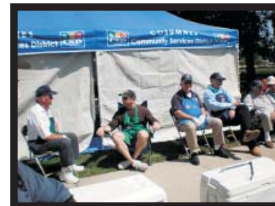
My goodness is this hard work!