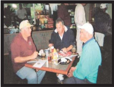
What to hear MY "fish story?"