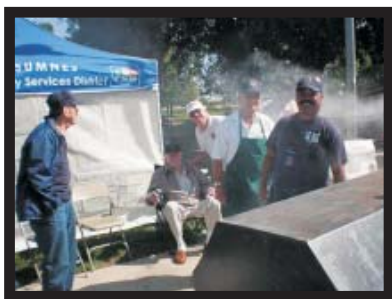
Me thinks that the burgers and dogs are smoke enough!