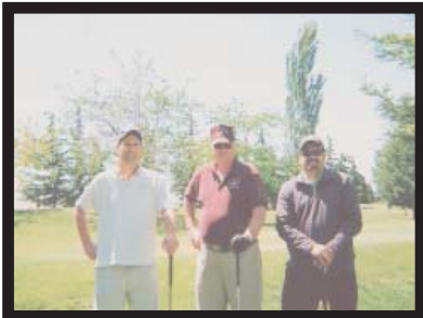
The club is helping me to stand!