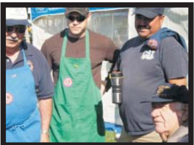
So, godfather - what do you think?