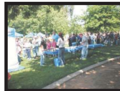
Okay! Lets eat!