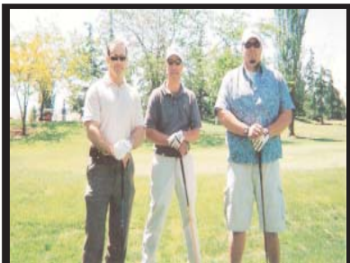
My driver is BIGGER than yours!