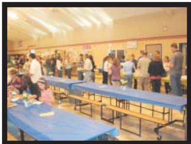
Looks organized. But where's the food?