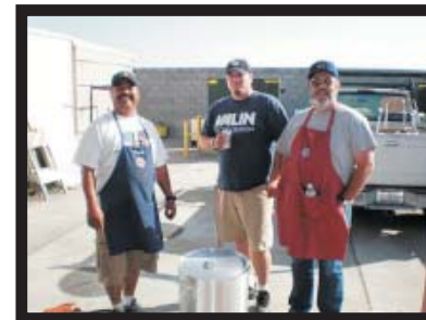
A watched pot . . . . . ?