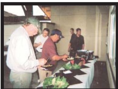
Can we eat all we want or come back for seconds?