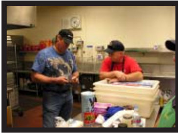
Back in the days when I was a kid, we didn't have really have neat kitchens like this one!!

Okay, "Do I hook this line on to this here value or the other one? I still like charcoals and just a match better.