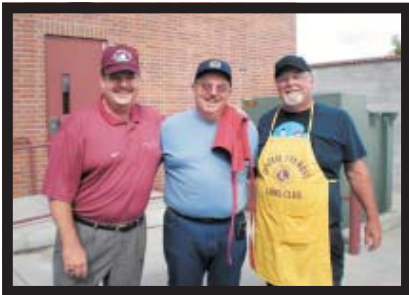
They are the best cooks in the world!