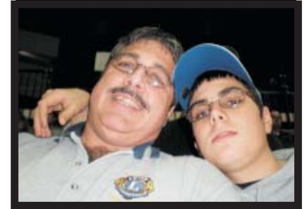
Aren't they cute?