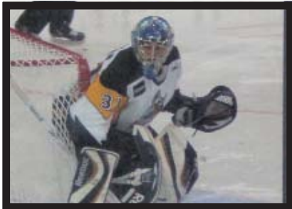
Anyone see the puck?