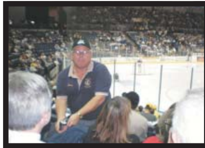
I like watching the fans! To heck with the game!