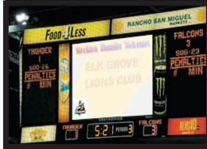
ONLY Organization that was recognized on the jumbotron!