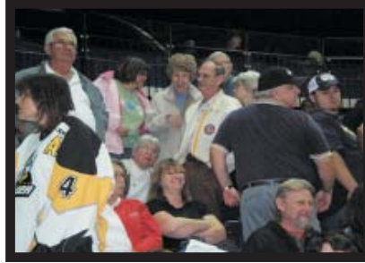
Lets see I've got seat R-23?