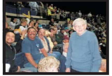
Smiles everyone - Smiles?