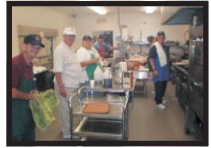
How many cooks does it take?