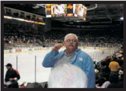
Can you hear me now?