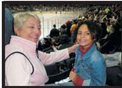
This is my granddaughter Is't she soo cute!