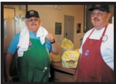
WE got ALL this at a discount at Grocery Outlet!!