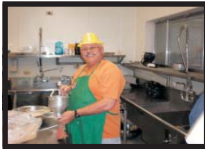
You want breakfast, when?