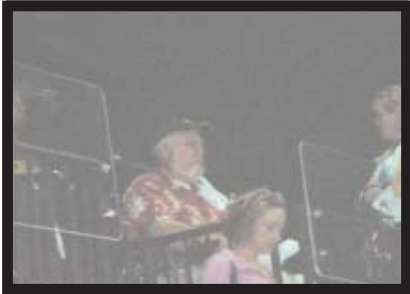
How did HE get here, I didn't see him on the bus?