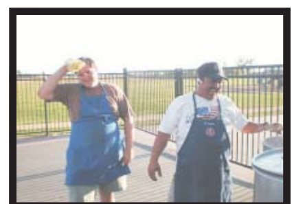
MG is it HOT out here!