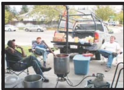
Boy! Is this an exhausting job!