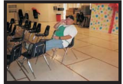
This is how we look after a hard twenty minutes!