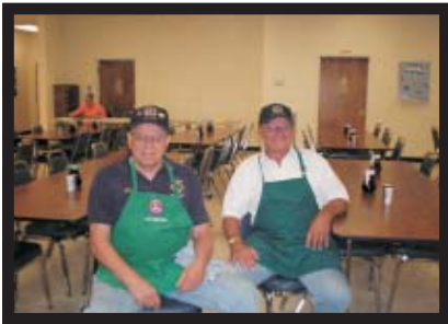
So, when do the people get here?