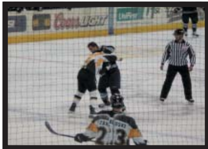
OH, I love you too!