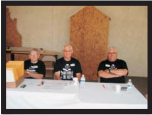
Huey, Duey and Louie staff the reception table.