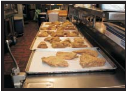
Frozen Chicken cooks real easy?