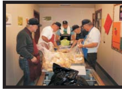
I think this is RAW!!