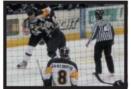
My mother is a what??