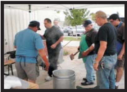
Is it boiling yet?