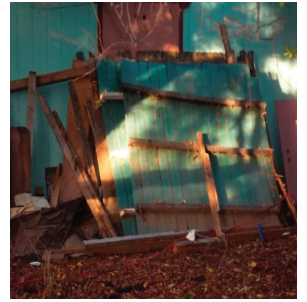
I don't see anything wrong with the color