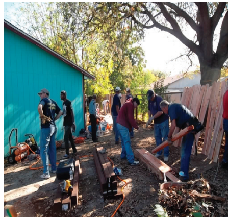
Hey, let's paint the fence the same color as the house?