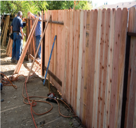
Do the boards go on the north side or south?