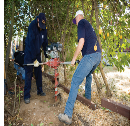
Let's get this holes straight?