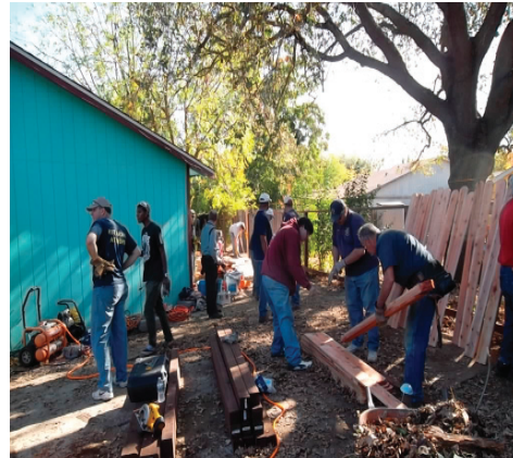
Lets see is that measure twice?