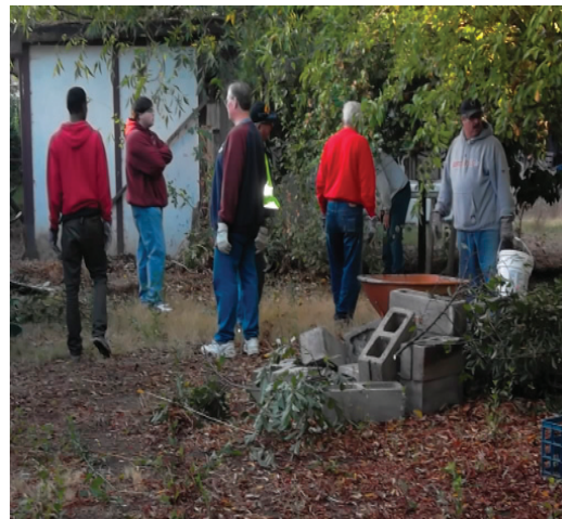
What the heck did they do with all these bricks?