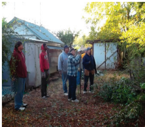
I think we should cut down that Oak!