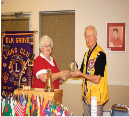
Another Thank you from the Strauss Festival