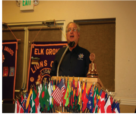
If anyone can tell me what was his topic was, I'll buy dinner.