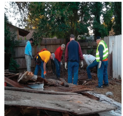
This dirt feels like concrete