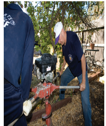
Still trying to get it straight?