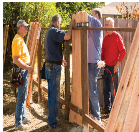
It may be level?