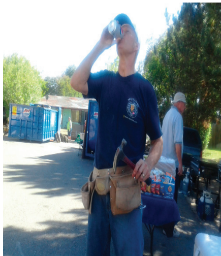
Time out for a "cool one"