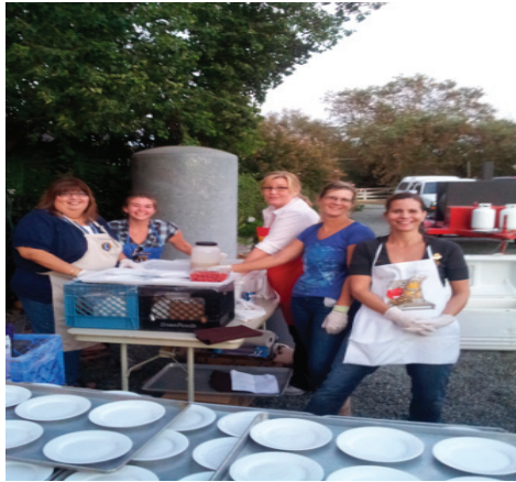
Have we changed?