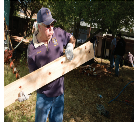
Boy are these boards heavy!