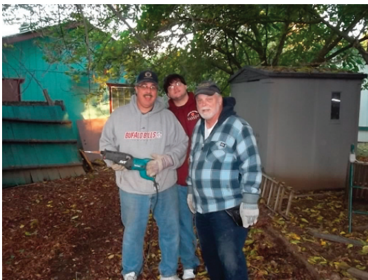
The Three Musketeers or The Three Stooges?