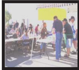
Did some one in the store announce "free meal"?