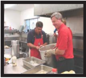
Do you think we would make good "Mess Cooks"?