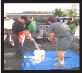
This is the same way we mix paint!