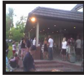
It wasn't all "work"