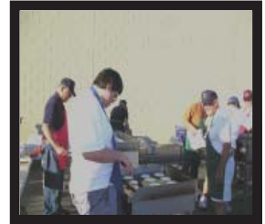
Just how many pancakes do I have to make?