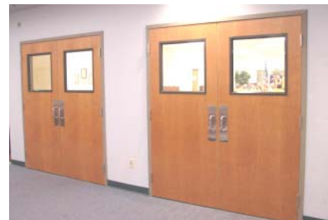
The Senior Center has new “doors”, thanks to the Elk Grove Lions