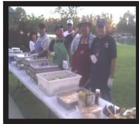
Lions staffed the "Chow Line"