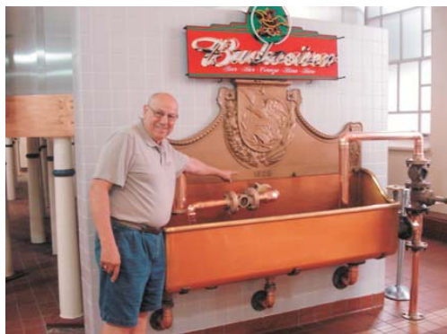
"ME" and "The Fountain" circa