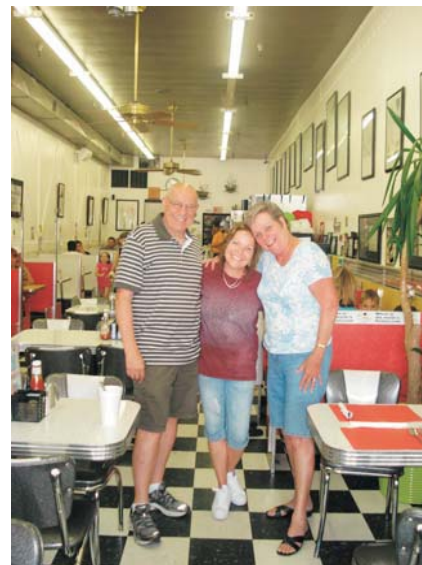
Famous Kelly O's. Pittsburgh PA. As seen on "Diners, Drive-Ins, and Dives" show hosted by Guy Fieri