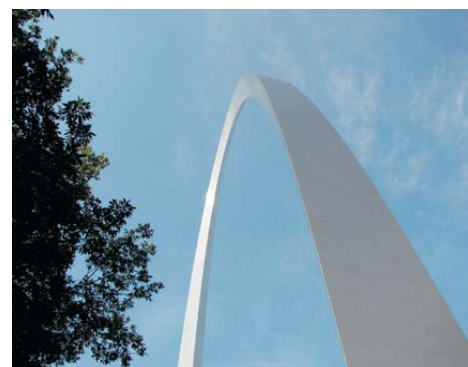
Where's the pot o' Gold?