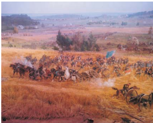
Painting of "Round Dome"

The bloody, three-day Civil War battle that took place in July of 1863 and saw 53,000 lives lost is depicted in spectacular style in this epic picture.