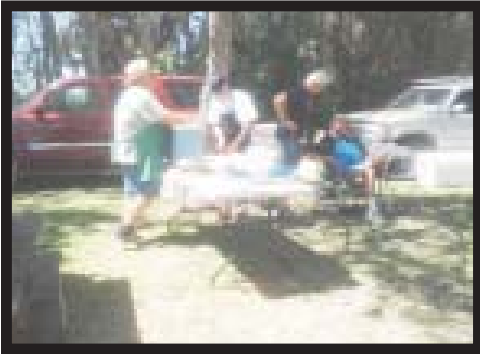
It doesn't always look like it, but there's a lot of preparation needed.