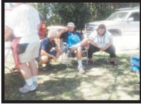
There was plenty of time for rest and reflection