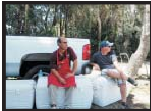
Sometimes there was far too much R & R