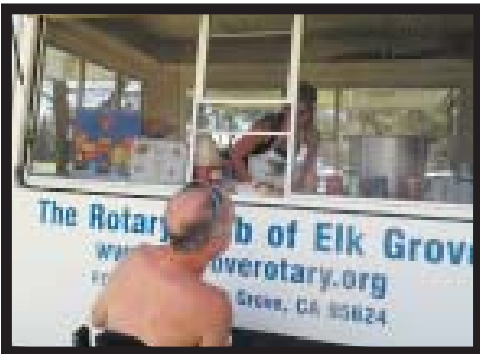
We also served hamburgers, & vegi-burgers for those that didn't want Tri-Tip