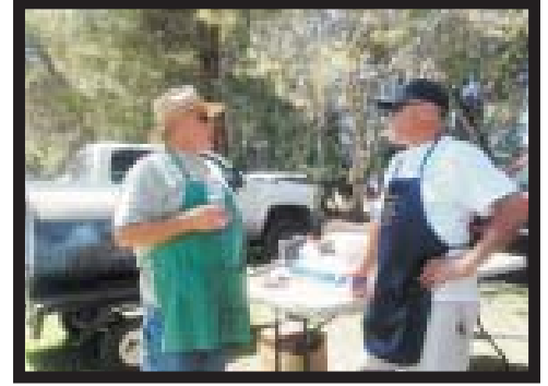
We had the "Best" of cooks and advisors!