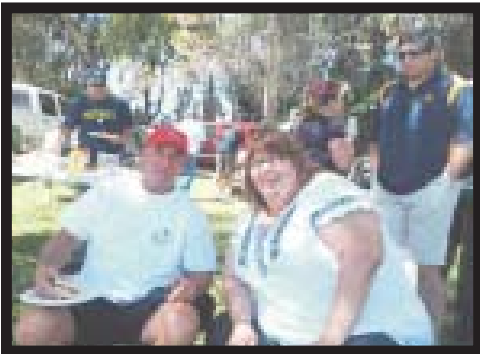
Politics were not discussed! (sure)