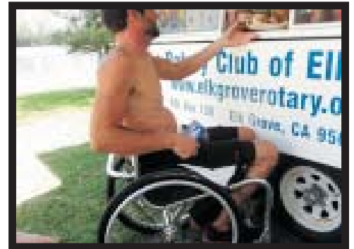
Over 150 Tri-Tip meals were served.